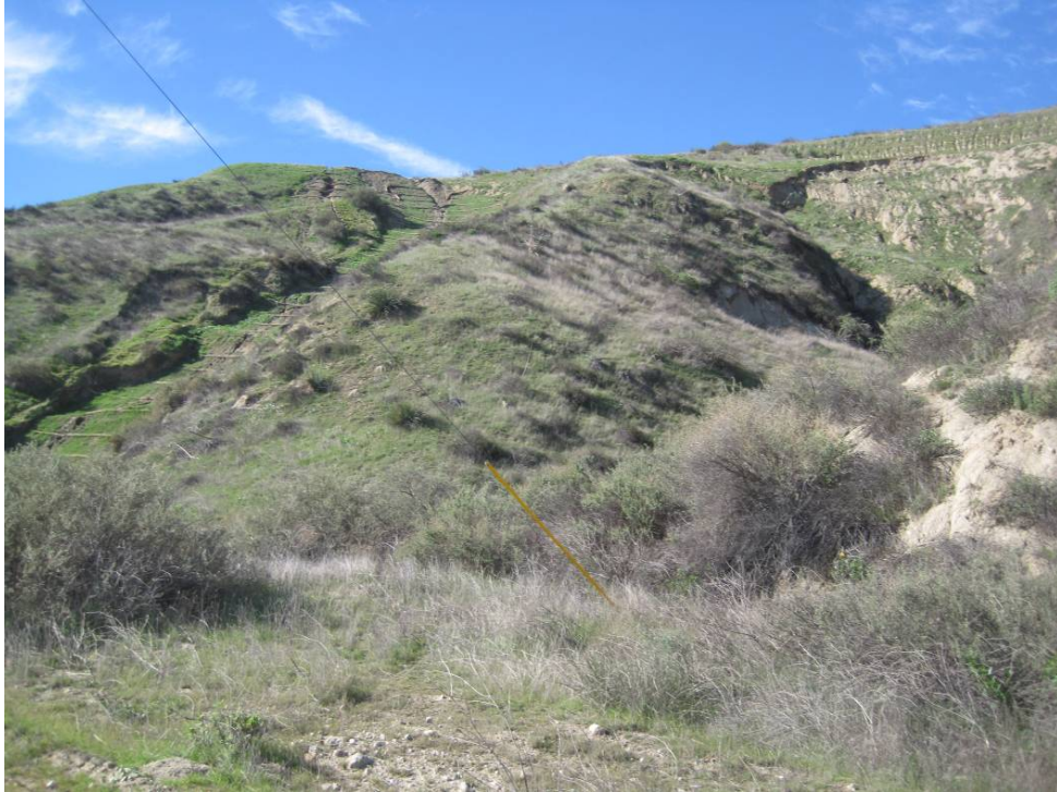
Photo 3, View north of survey area on the north end of CCL.