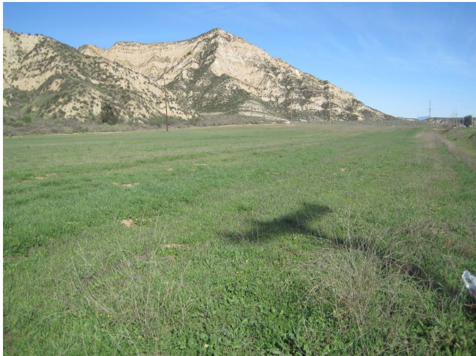
Photo 2, View northeast of survey area near SR-126.