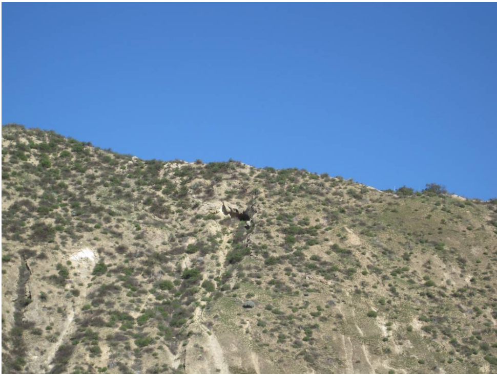
Photo 4, View north of CA-LAN-36, from the edge of the proposed grading footprint.