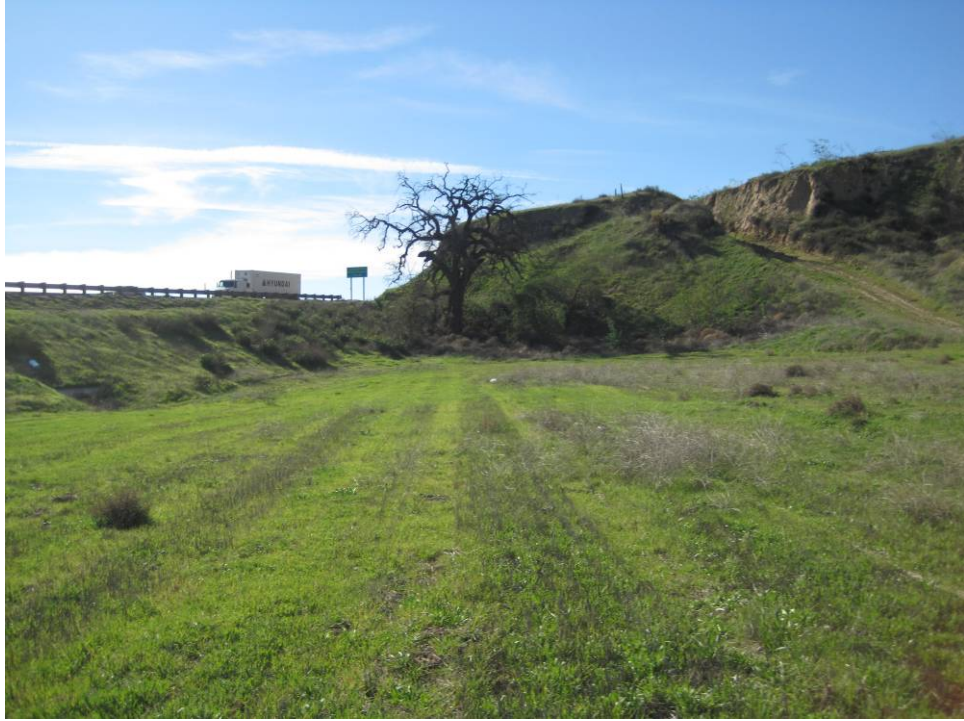
Photo 1, View west of survey area near SR-126.